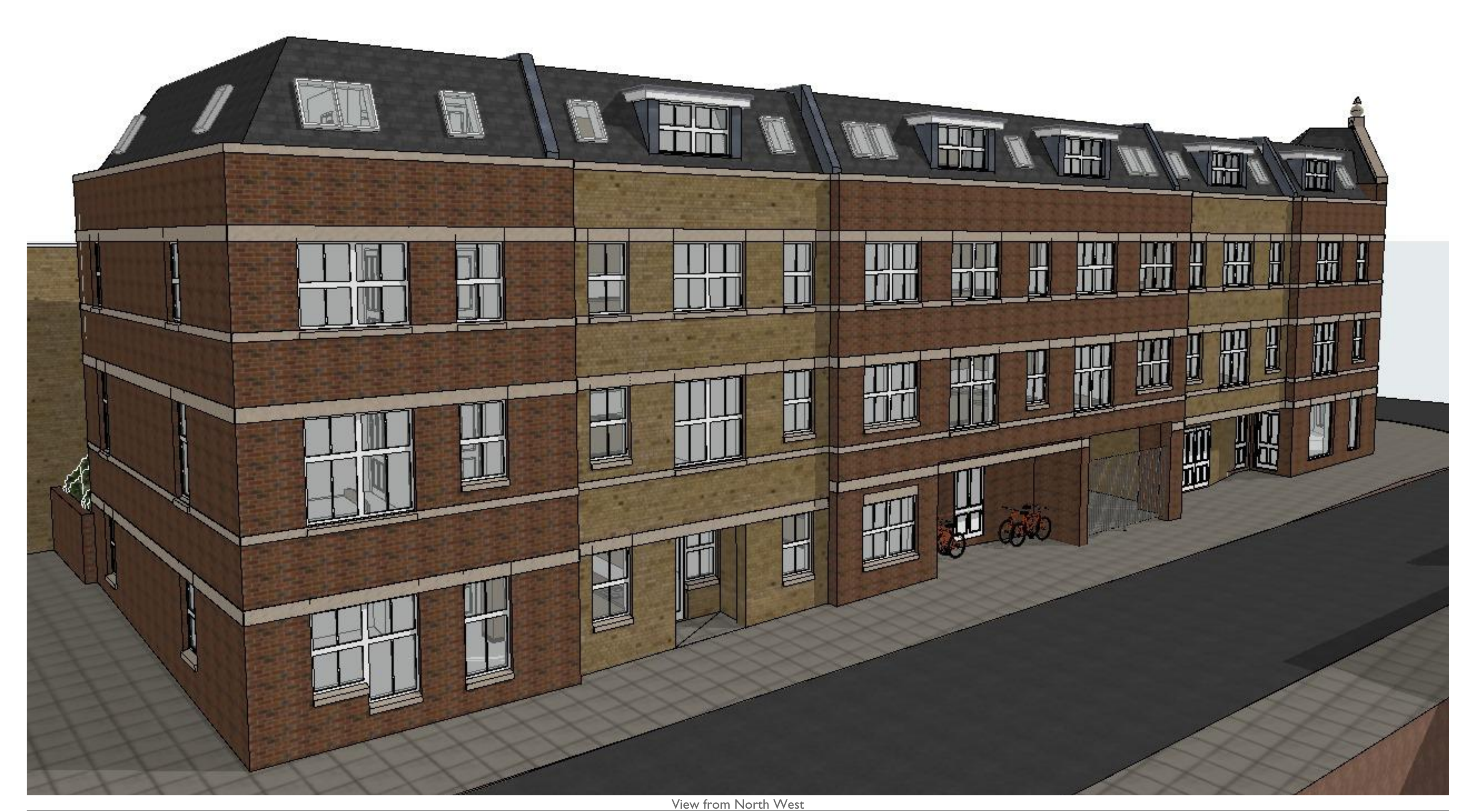
In-Excess Ltd 352-358 Ashley Road, Poole